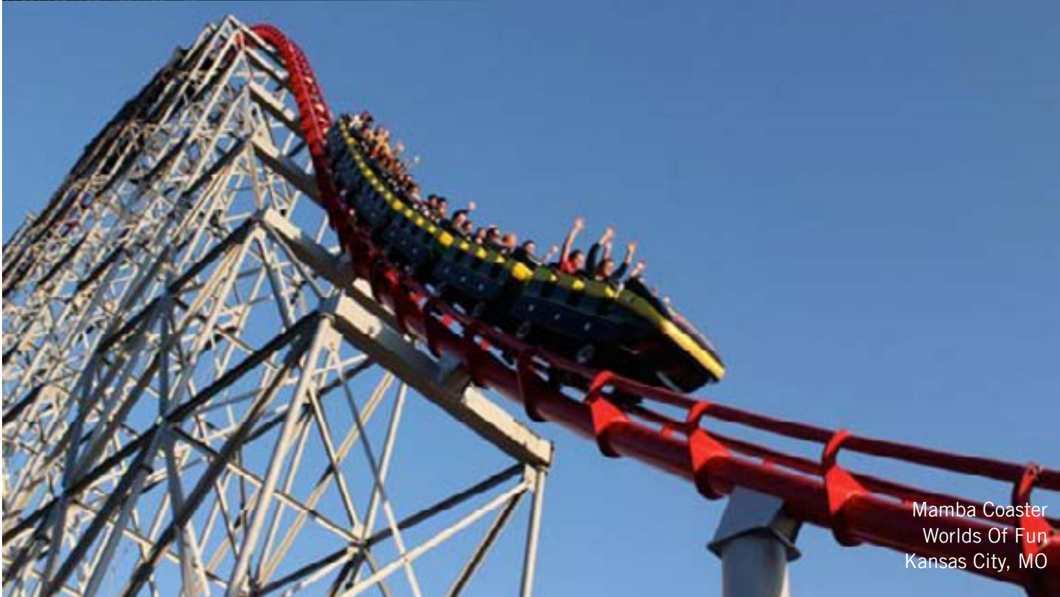
Mamba Coaster Worlds Of Fun Kansas City, MO