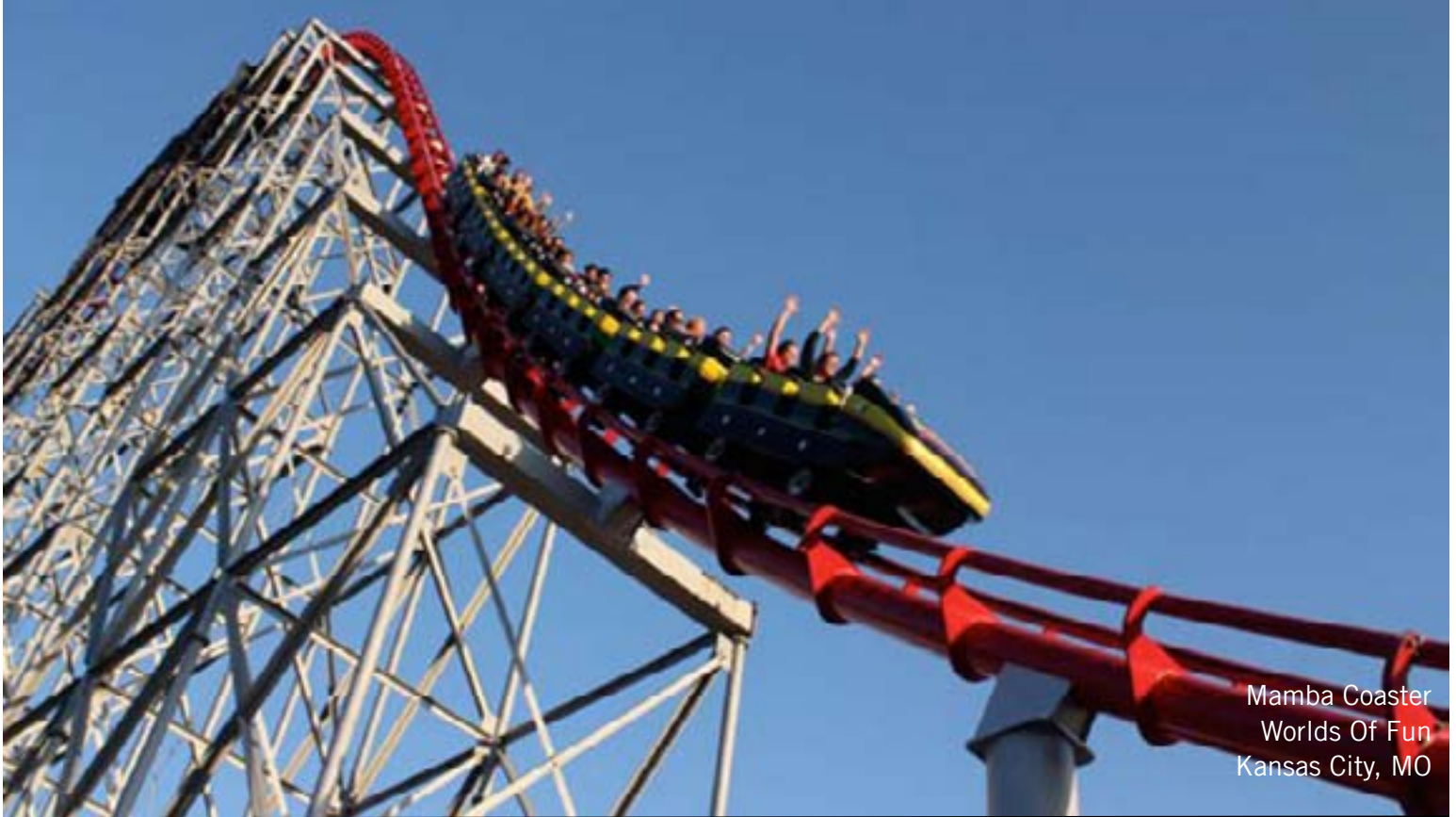
Mamba Coaster Worlds Of Fun Kansas City, MO